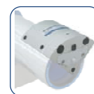
LF65 激光找像器 Laser Attachment