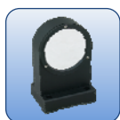
MA60 标准反光镜 Standard Mirror