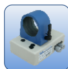
DZ65 二维可调底座 Adjustable Holder